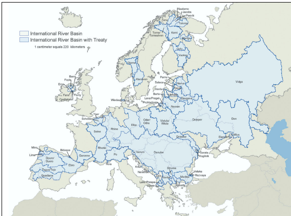
Fig. 1: International river basins and water treaties in Europe

Europe features a particularly long and rich history of international water cooperation. Between 1945 and 2000, a total of 118 international water treaties have been concluded in 45 of the 69 international river basins on the European continent ( see figure 1 ). While this figure provides an impressive account of international water cooperation in Europe, it should be noted that the treaties exhibit an unequal geographical distribution: The Danube and Rhine river basins alone feature 32 and 29 international water treaties and therefore account for more than half of the 118 water treaties (UNEP 2002: 77ff.).